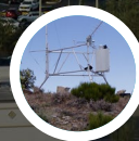
Fire Weather Data