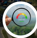
Air Quality Indicators