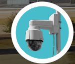
AI Smoke Detection

AEM's comprehensive ignition detection sources