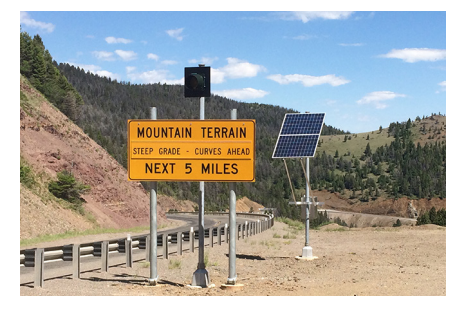
ROAD WEATHER SENSORS AT CRITICAL LOCATIONS