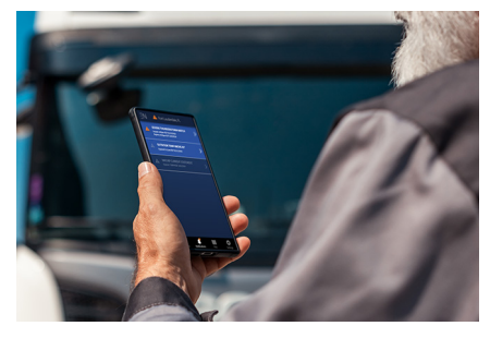
MOBILE WEATHER ALERTS