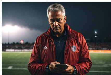
OUTDOOR ALERT & NOTIFICATION SYSTEMS