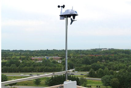
RUGGED, DEPLOYMENT READY WEATHER STATIONS