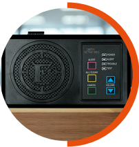
INFORMER CONTROL BOX