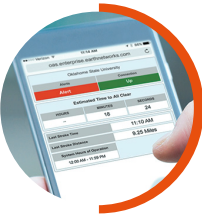
ALL-CLEAR COUNTDOWN CLOCK