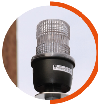
AUTOMATED STROBE LIGHTS