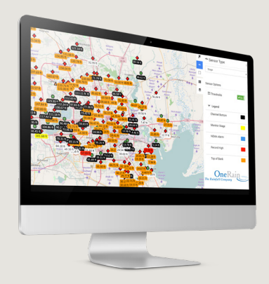
Contrail software showing HCFCD Stage Map during Hurricane Harvey, August 2017.