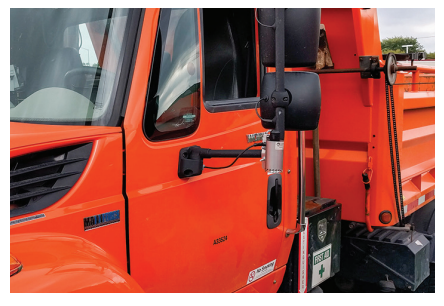
PAVEMENT CONDITION MONITORING