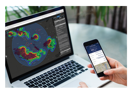
LIGHTNING & SEVERE WEATHER TRACKING AND ALERTING