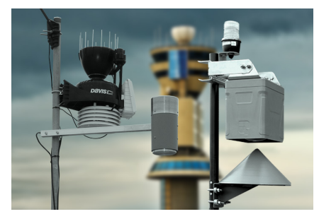
PRECISION WEATHER STATIONS AND OUTDOOR ALERTING